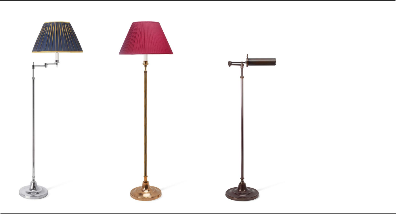
1) Buckingham Swing in polished nickel 2) Buckingham Standard in distressed brass 3) Buckingham Trough in bronze